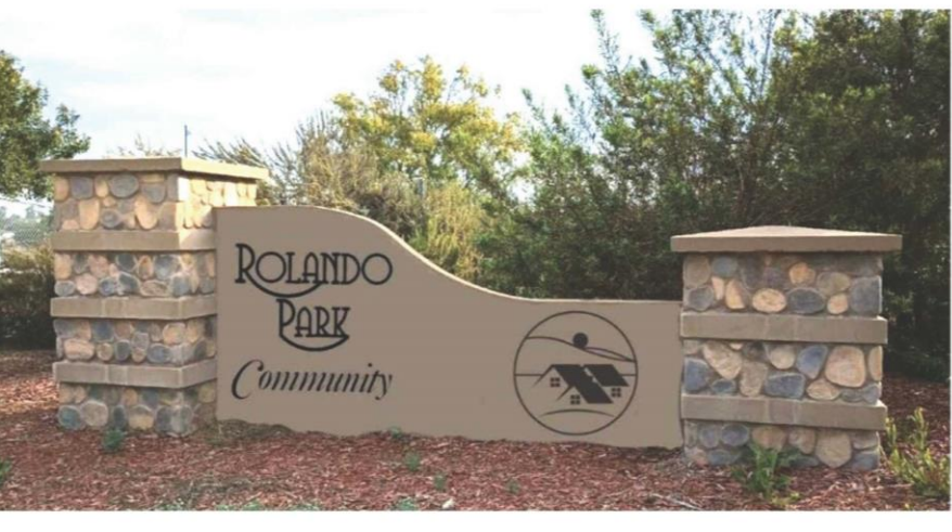
Similar Example at Entrance To Chollas Lake Park