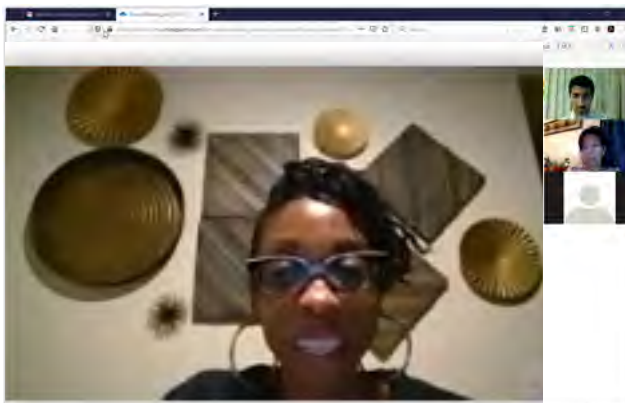
Our city councilmember Monica Montgomery attended our special April 27 online meeting on COVID-19

We'll still use the same agenda format as our in-person meetings and community representatives from local government and SDPD will still be present. We'll open up at least 15 minutes early for informal conversation before the meeting starts. Most of the time, we'll have a formal presentation on a topic of interest to the community. There will be plenty of