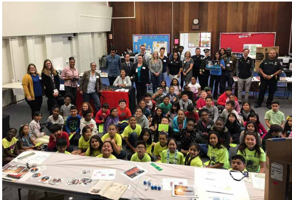
RPE's first Career Day

The 3rd, 4th, and 5th grade girls participated in a Girls on the Run event at Crown Point Park on May 5. The Girls on the Run program teaches girls important