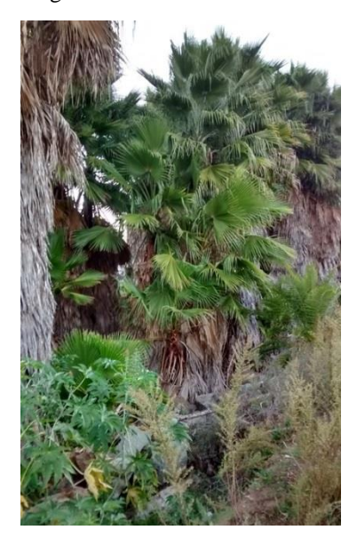
November 20, 2016

On January 14, RPCC was notified that as a result of the recent storms, the Chollas Creek Drainage Channel had become an emergency project for the City of San Diego. Work started the next day to clear the overgrowth of palm trees and other shrubs blocking the storm drain and is now almost complete. What a difference!